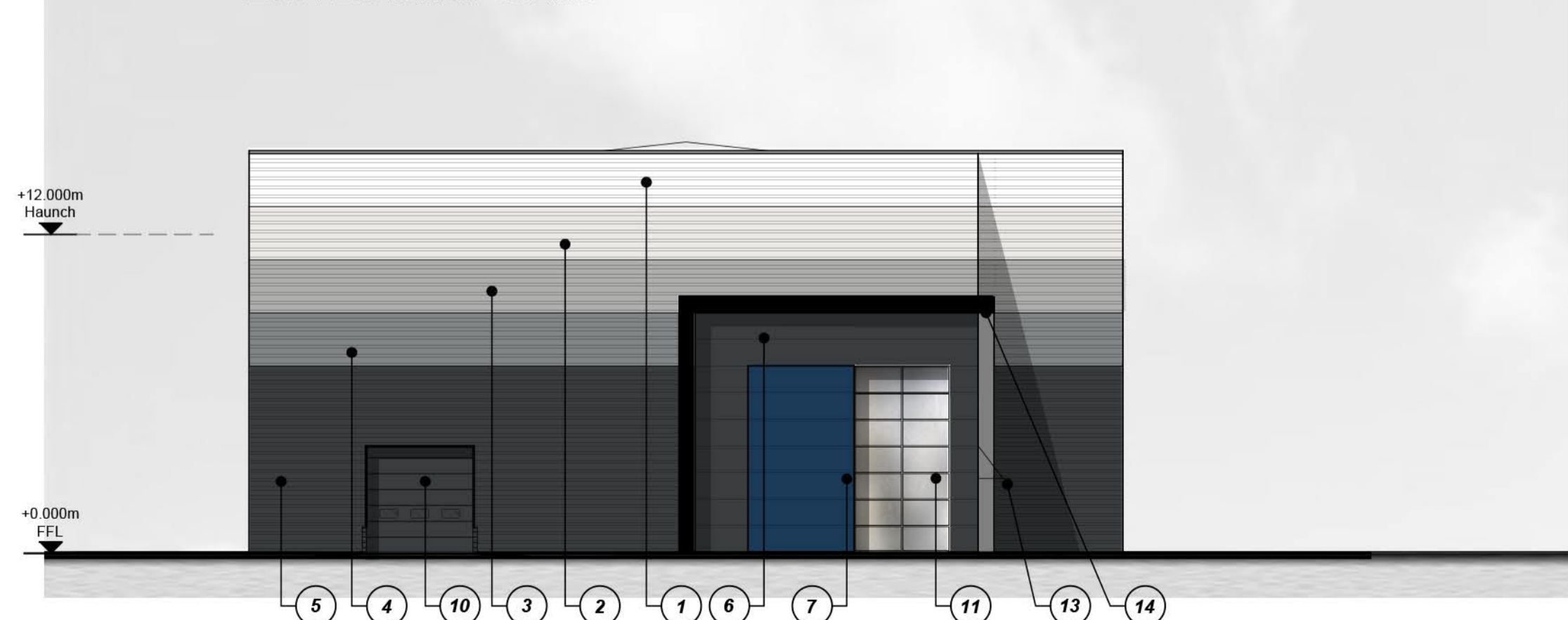
West Elevation Scale 1:200