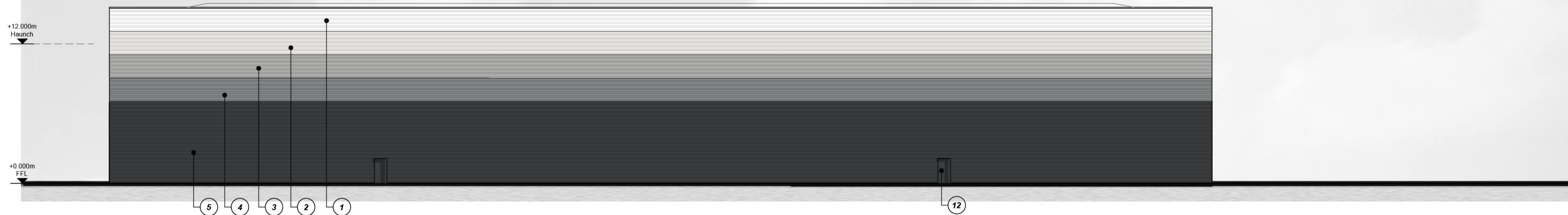
North Elevation Scale 1:200