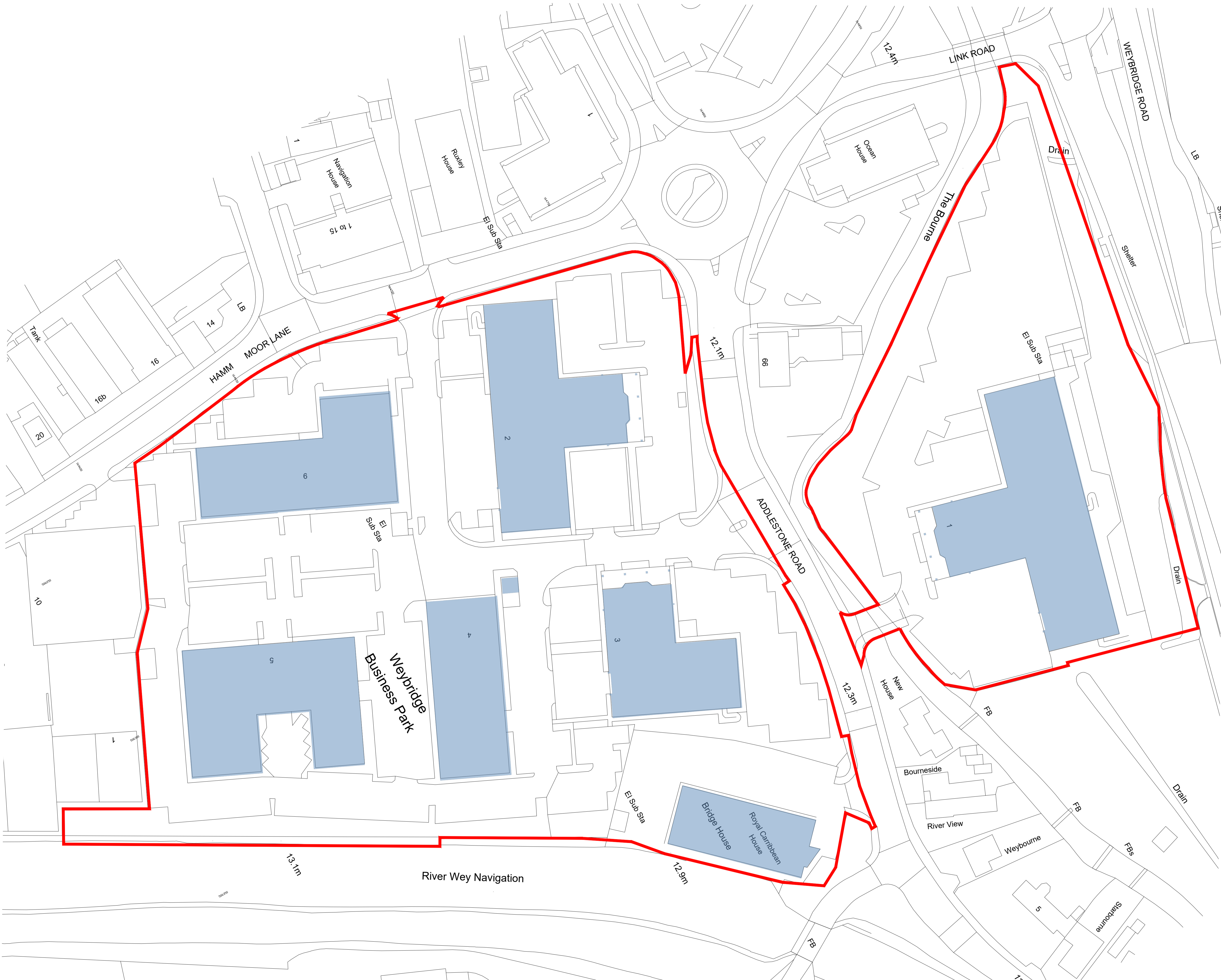
Existing Block Plan Scale 1:500