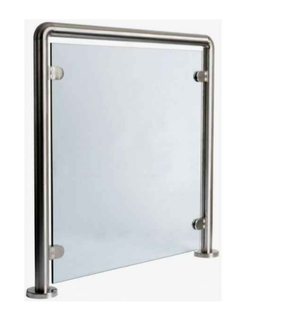
Door Barriers Location: Main entrances Finish: Stainless steel Note: Barriers to be fixed in place to substrate beneath finished surface, with block paving out to suit to conceal fixings.