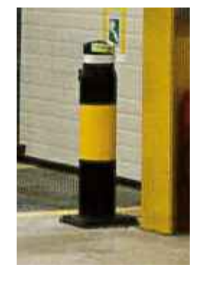
Heavy Duty Bollards Location: Level access doors Dock retaining walls Finish: Steel with Black and Yellow polymer sleeve