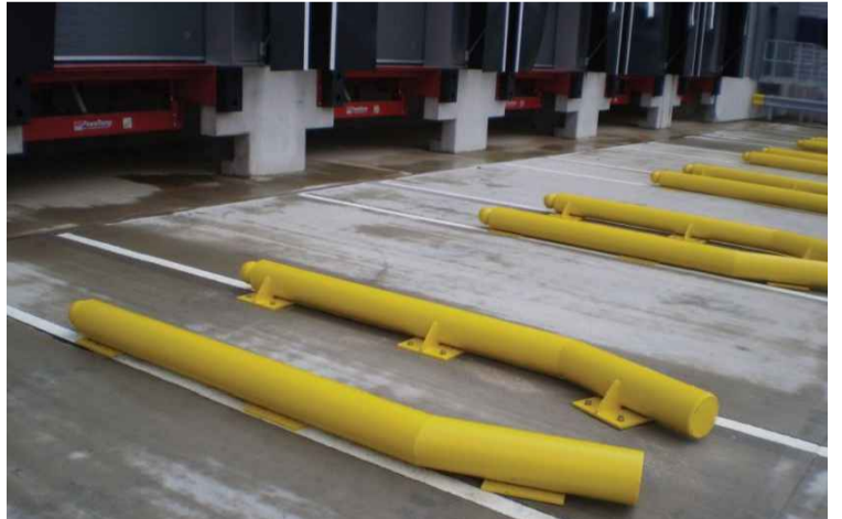
Wheel Guides Location: Service yard Colour: Yellow