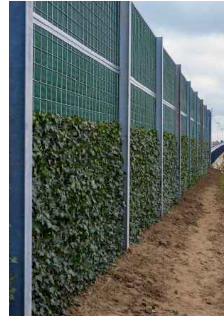
Acoustic Fence Size: 1m high 4.5m high 5.4m high