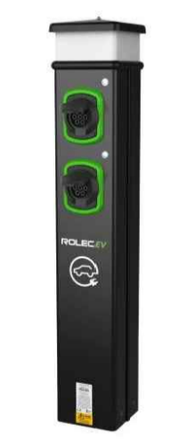
Electric Vehicle Charging Posts Location: Car park