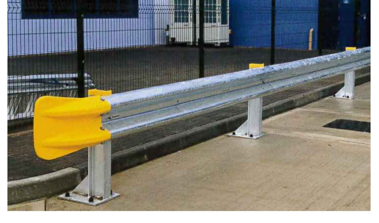
Armco Protective Barriers Location: Dock retaining walls with 1100mm handrail. HGV parking spaces against vulnerable areas of elevations Office Core and escape stair perimeter Finish: Galvanised Steel