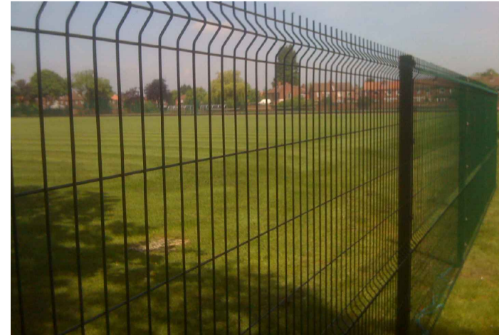
Paladin Fence and Gates Size: 2.4m high