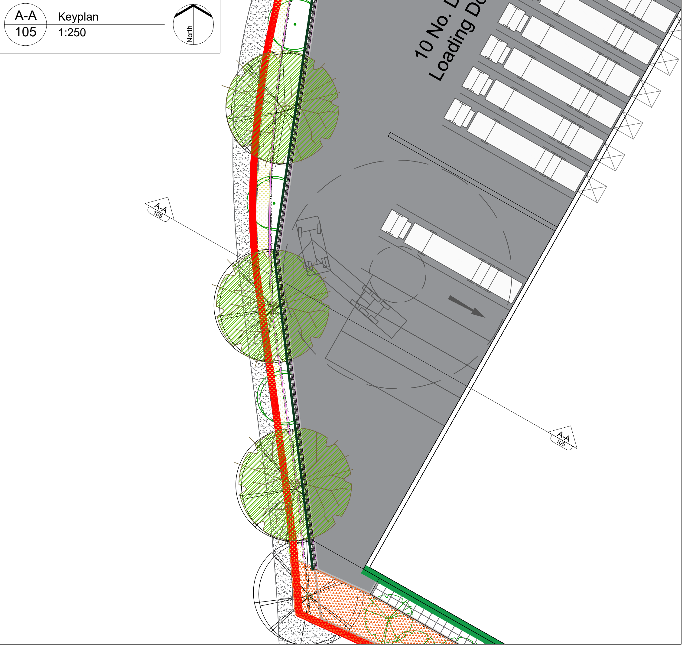
A-A Keyplan 105 1:250