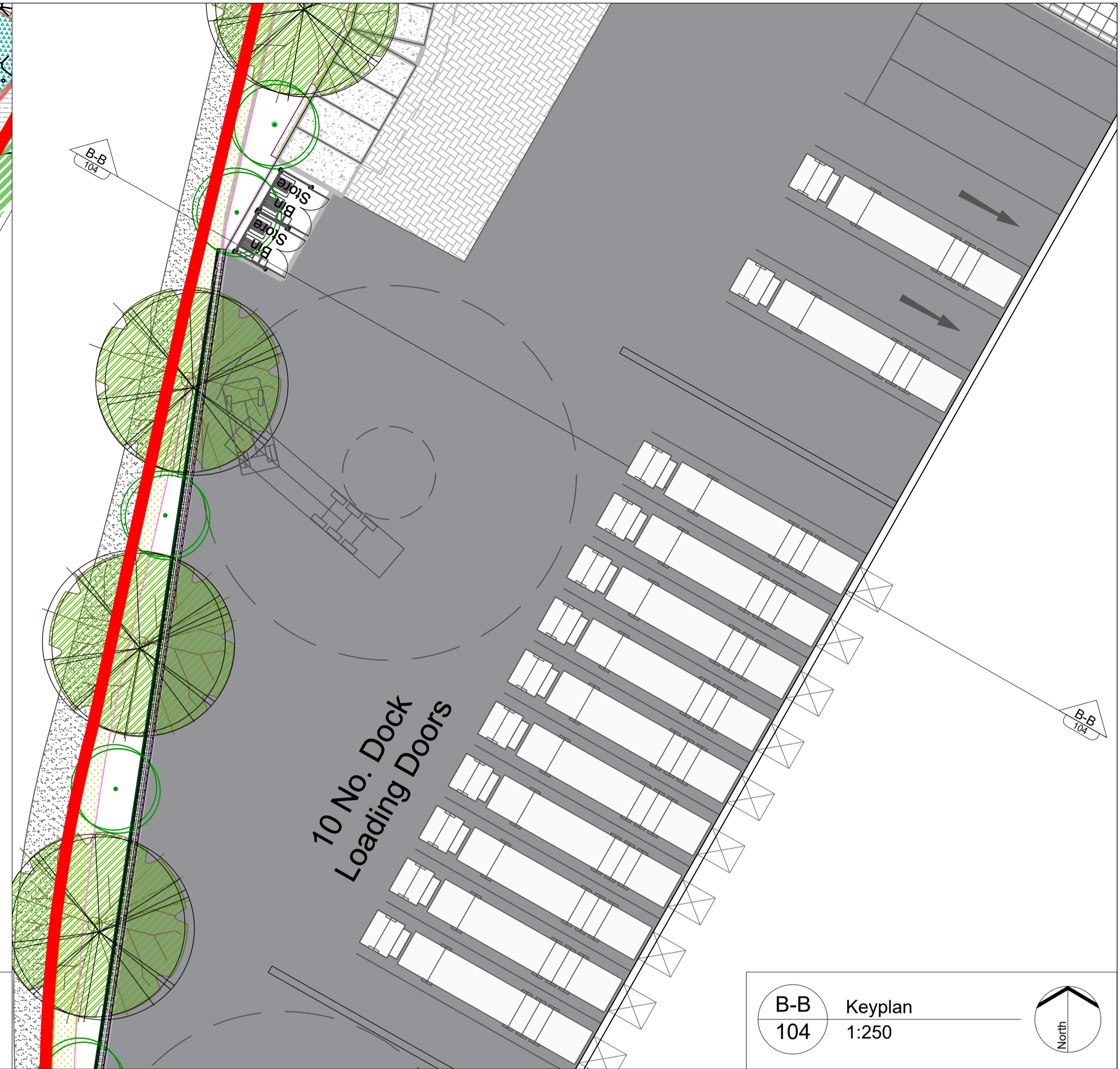
B-B Keyplan 1:250