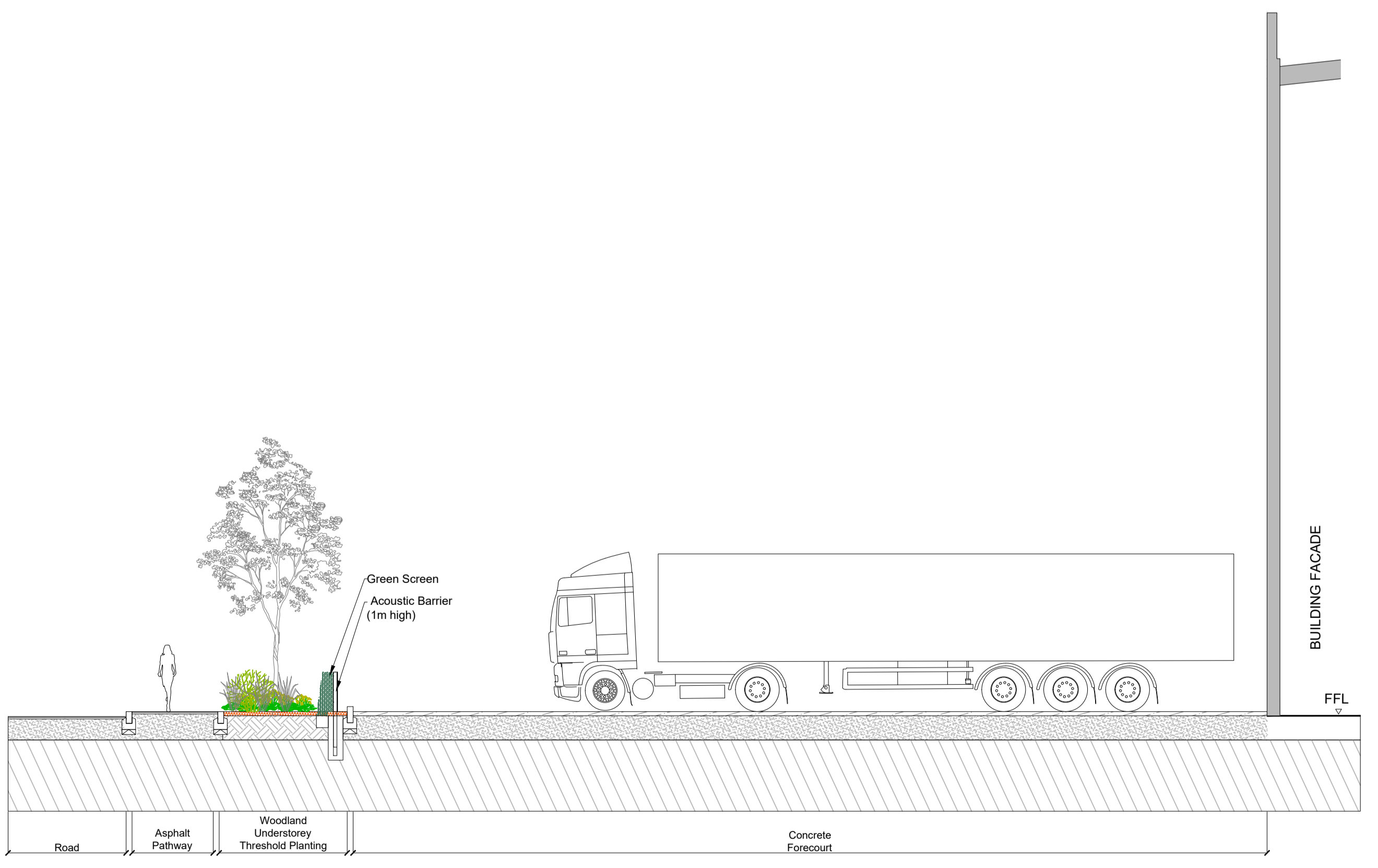
A-A Acoustic Fence Ham Moor Lane 105 1:100