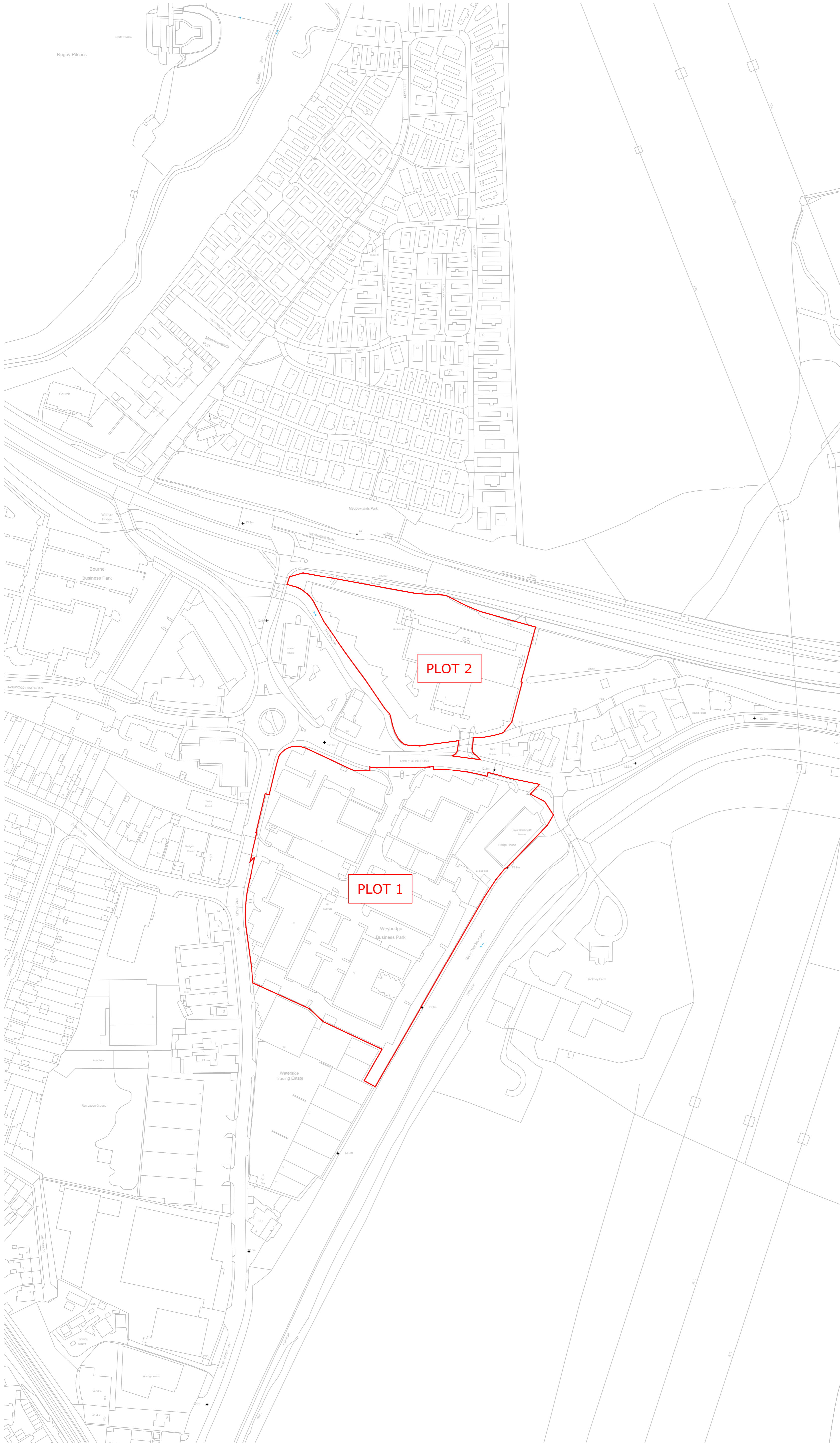
Proposed Location Plan (Scale 1:1250)