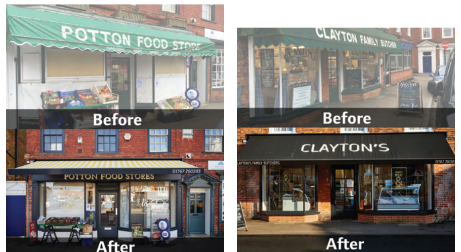
Examples of how shopfront grants have helped support local businesses and improve other town centres.

Tell us what you think of the ideas to improve the heritage character