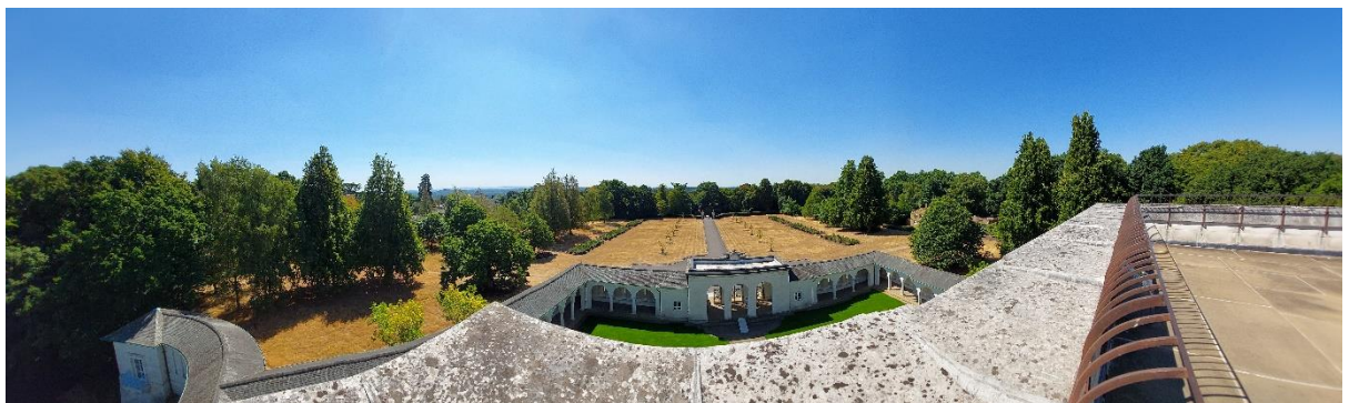
Air Force Memorial AF3