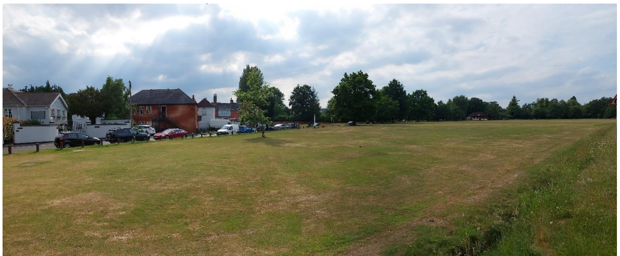
Green View G1