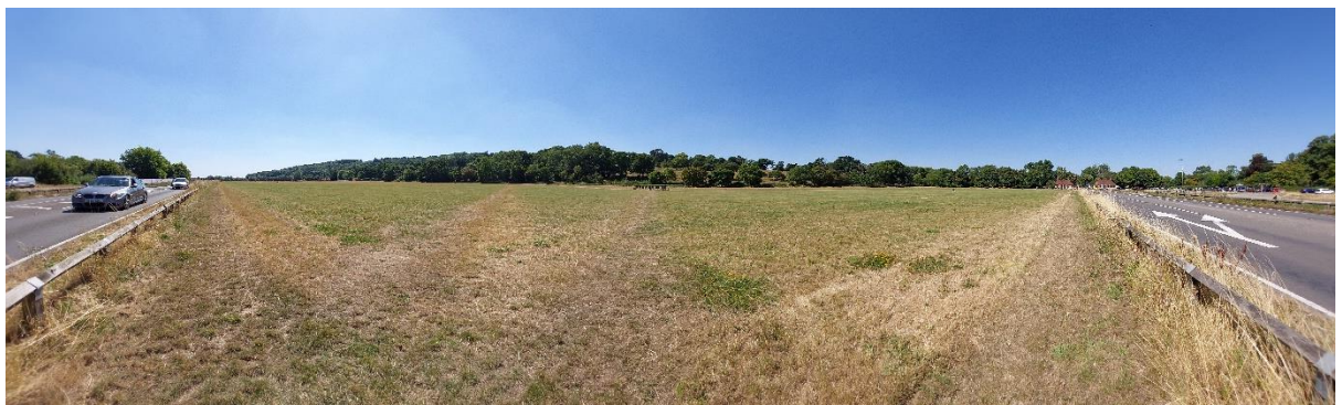
Runnymede Meadows View R1