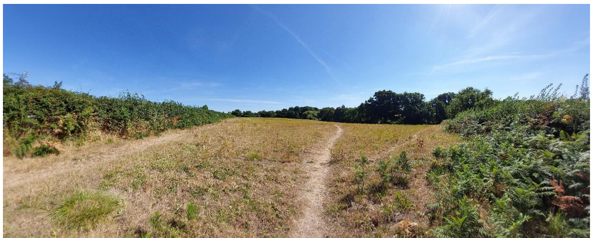
Ham Lane Footpath View H1