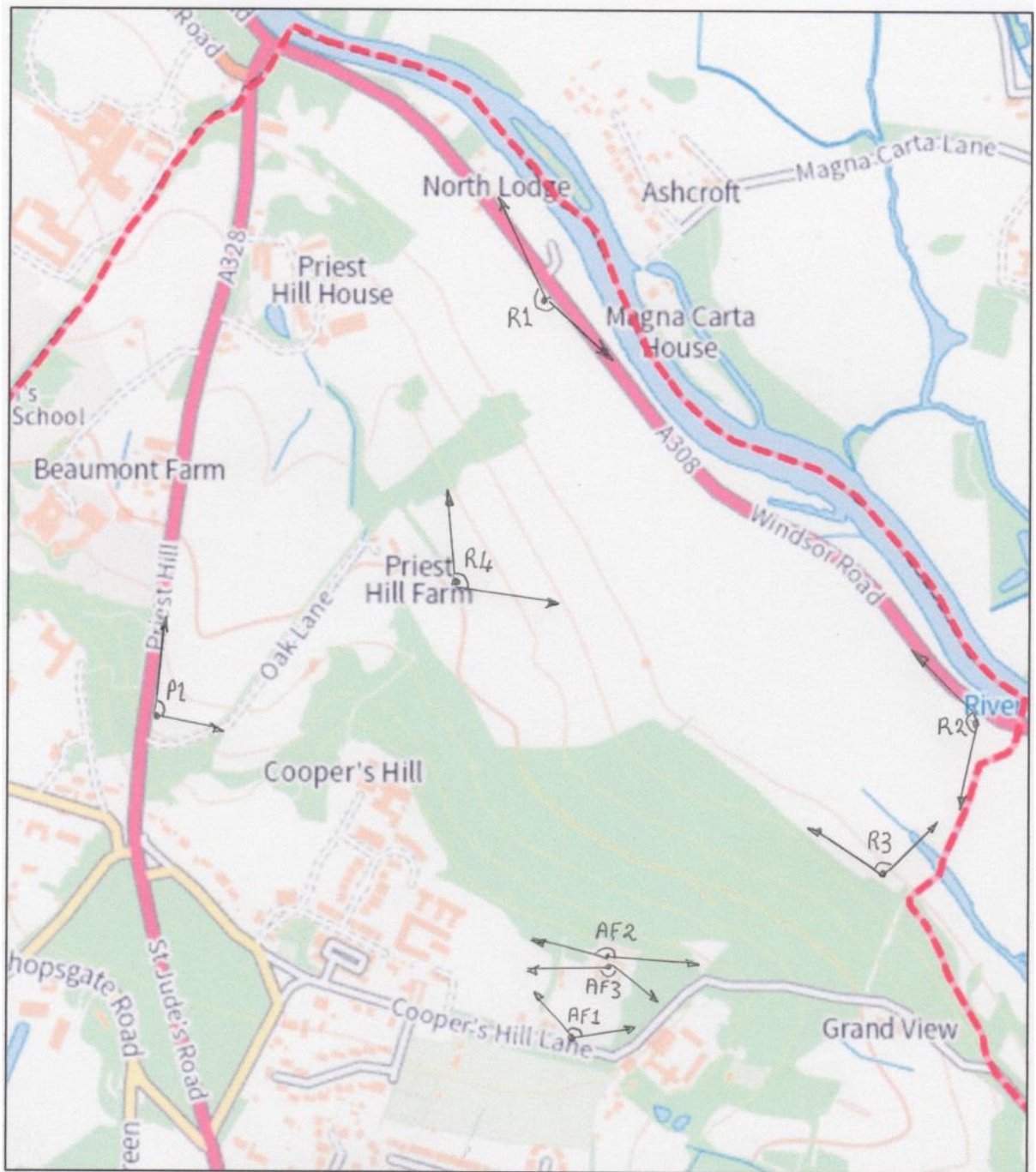
Priest Hill, A308, Air Force Memorial and Runnymede Meadows Views