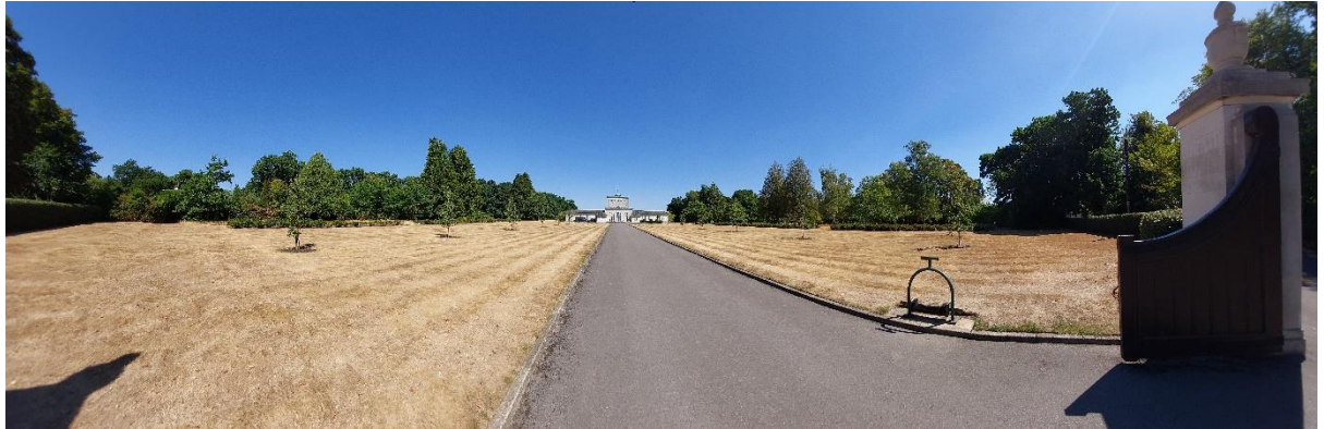
Air Force Memorial AF1