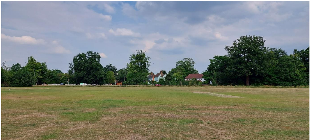
Green View G3