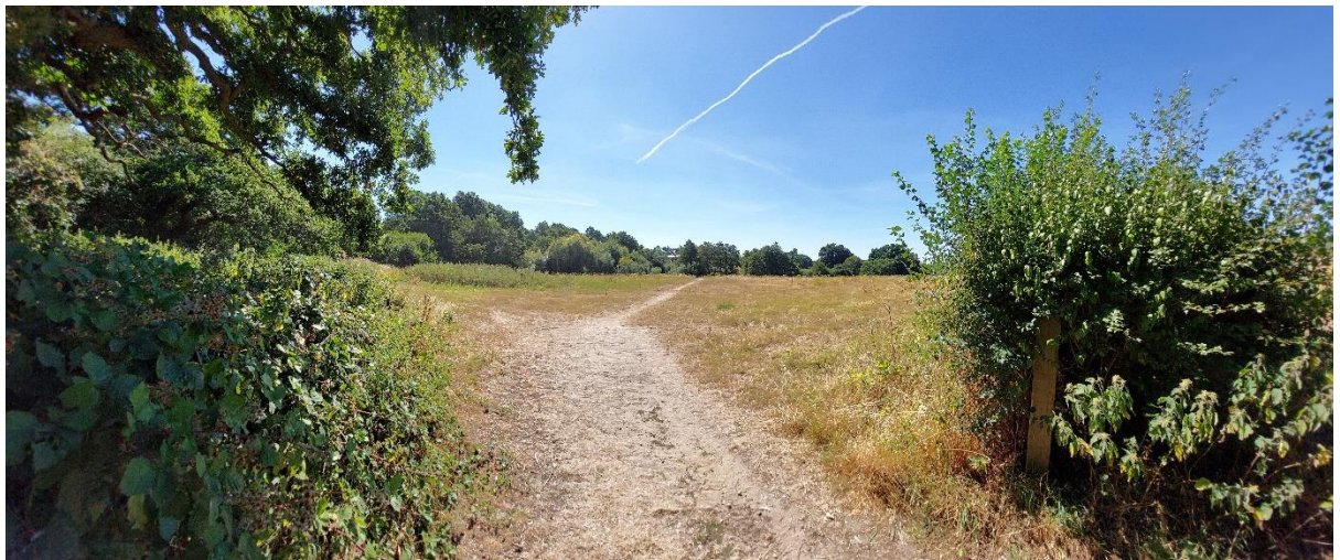
Ham Lane Footpath View H4