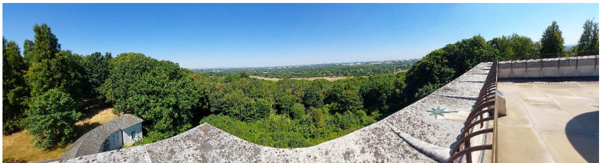
Air Force Memorial AF2