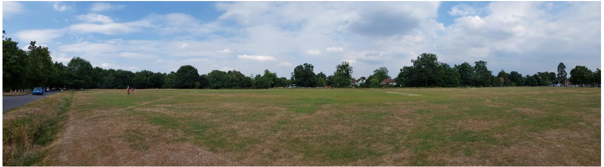
Green View G2