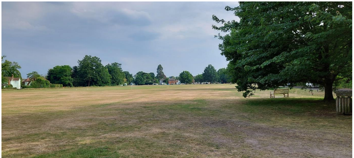
Green View G4