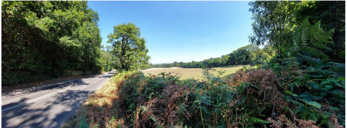
Priest Hill View P1