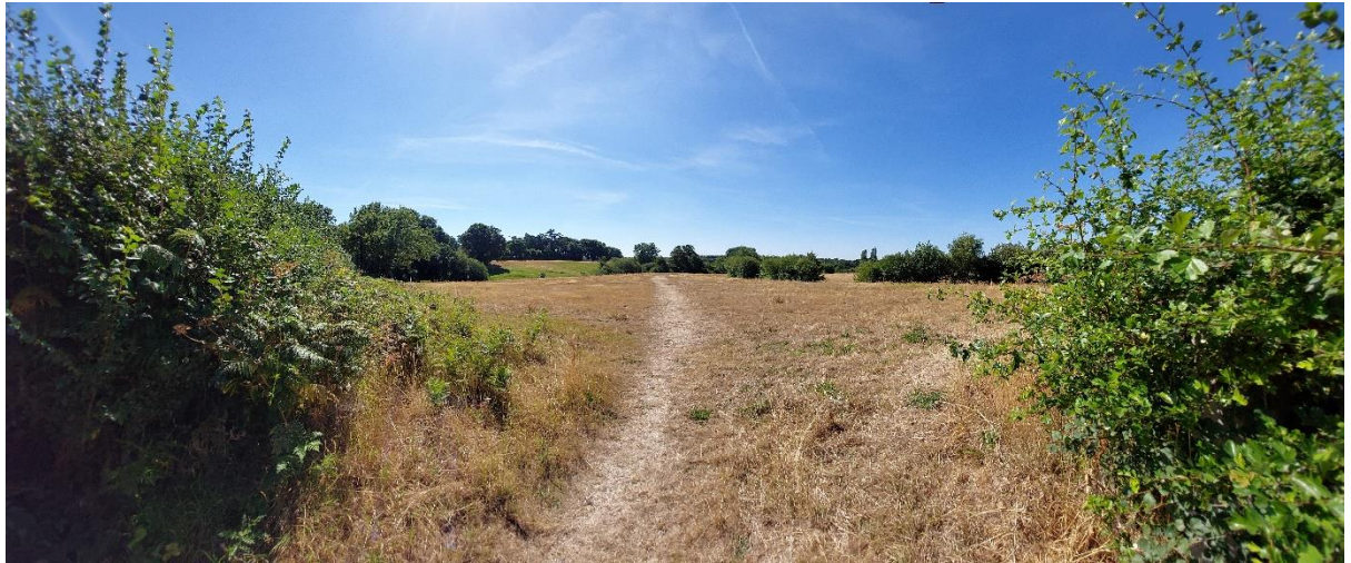
Ham Lane Footpath View H2