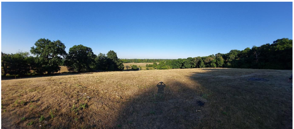
Runnymede Meadows View R4