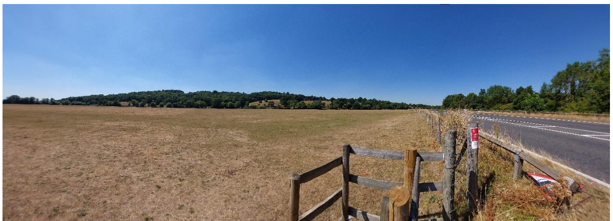
Runnymede Meadows View R2