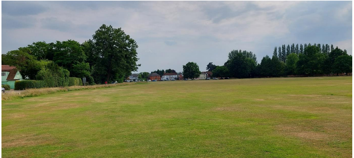
Green View G5