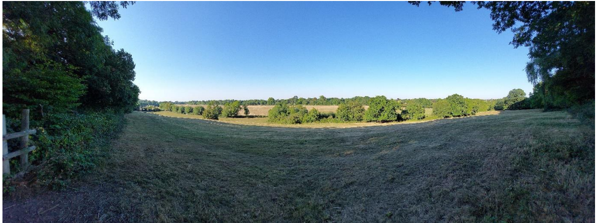
Runnymede Meadows View R3