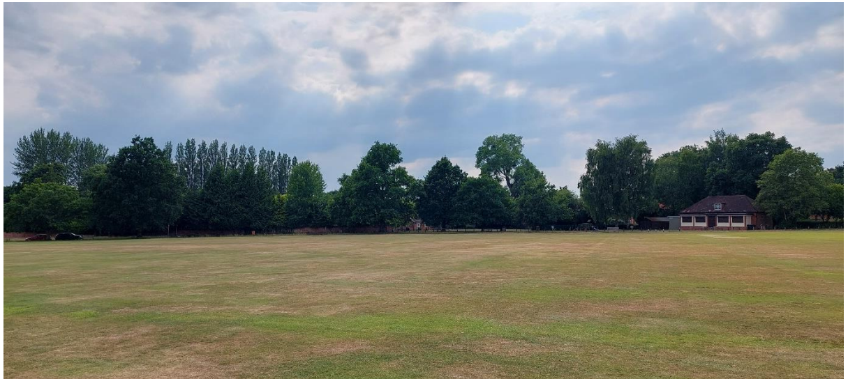
Green View G6