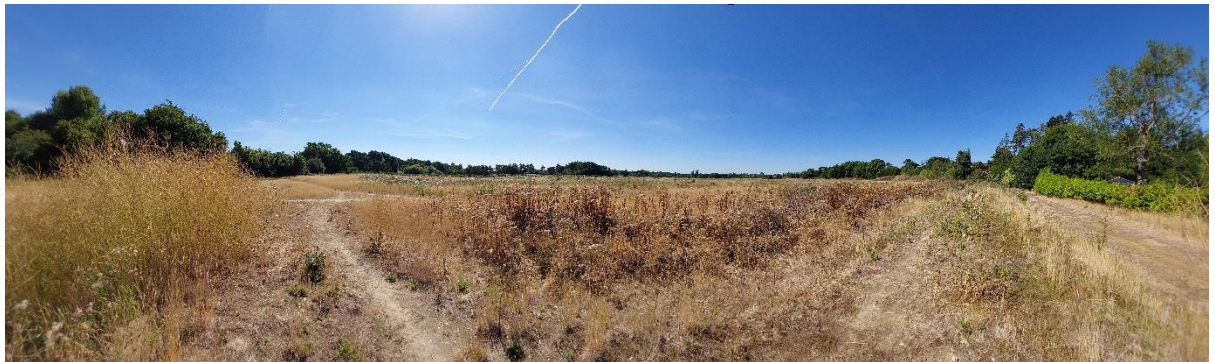
Ham Lane Footpath View H3