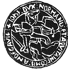
Mayra Charles Sealed at Runnymede 22.15 A.D.

Plans showing the extent of these conservation areas can be seen at the Civic offices, Station Road, Addlestone.